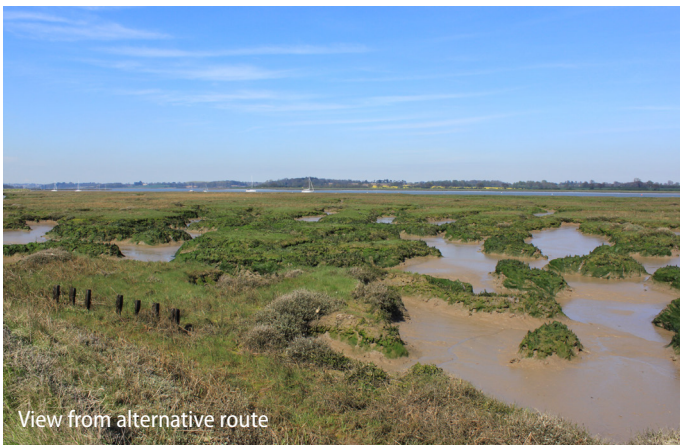
View from alternative route